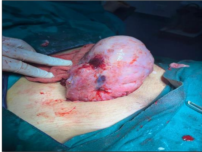
Figure 4. Uterus Post Lscs.