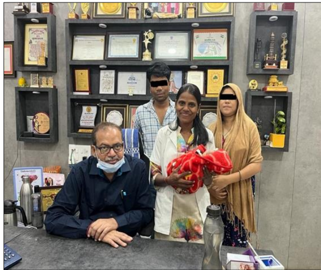
Figure 5. Patient at time of discharge with healthy male baby delivered by LSCS at term.