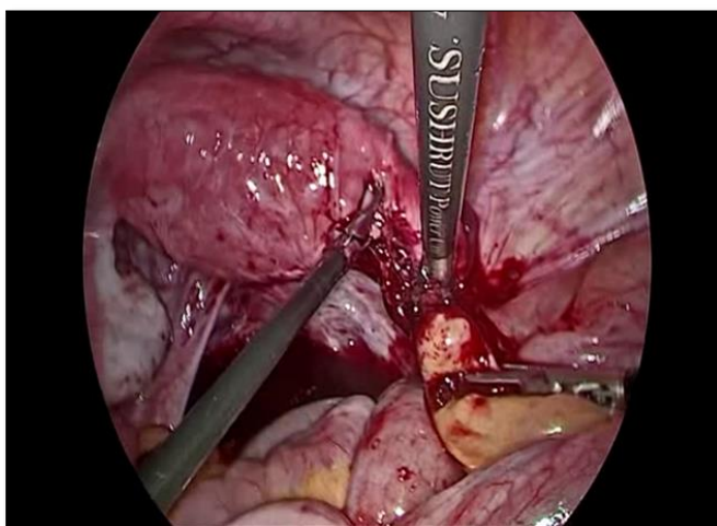
Figure 2. Laparoscopy guided incision was given at right cornu over the bulge and endometrectomy was done.